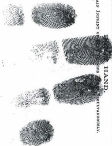
PLAIN IMPRESSION OF FOUR FINGERS TAKEN SEPARATELY.