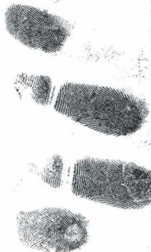
PLAIN IMPRESSION OF FOUR FINGERS TAKEN SEPARATELY.