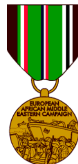
EUROPEAN-AFRICAN-MIDDLE EASTERN CAMPAIGN MEDAL