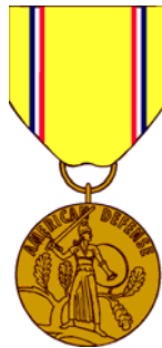
AMERICAN DEFENSE MEDAL