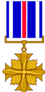
DISTINGUISHED FLYING CROSS