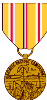
ASIATIC-PACIFIC CAMPAIGN MEDAL