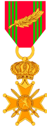
CROIX DE GUERRE BELGIUM