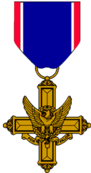
DISTINGUISHED SERVICE CROSS