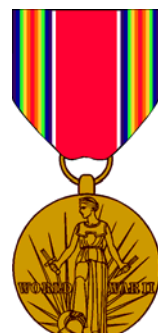
WORLD WAR II VICTORY MEDAL