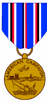
AMERICAN CAMPAIGN MEDAL