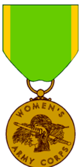
WOMENS ARMY CORPS MEDAL