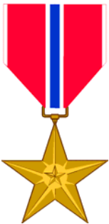
BRONZE STAR MEDAL