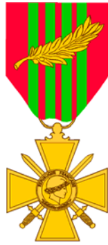
CROIX DE GUERRE FRANCE