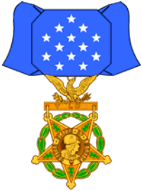
MEDAL OF HONOR