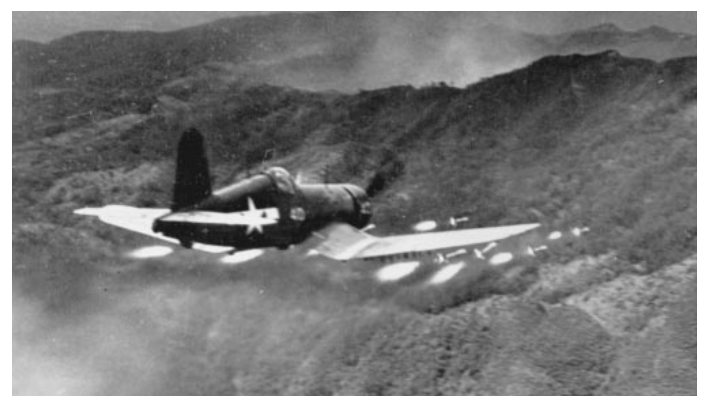
Marine F4U in rocket attack on Okinawa

ously damaged the carrier Franklin and scored hits on four others. For the next three months the fast carrier force operated continuously in a 60-mile-square area northeast of Okinawa and within 350 miles of Japan, from which position it neutralized Amami Gunto airfields, furnished close air support for ground operations, intercepted enemy air raids, and on occasion moved northward to hit airfields on Kyushu.