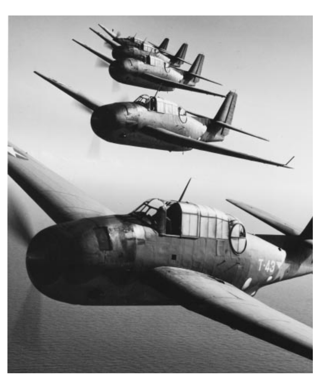
Formation of Grumman TBF Avengers 417667

the carrier air attack which began at 0930 with the heroic but unsuccessful effort of Torpedo Squadron 8, and were hit in full force at 1030 when dive bombers hit and sank the carriers Akagi, Kaga, and Soryu. A Japanese counter attack at noon and another 2 hours later, damaged Yorktown with bombs and torpedoes so severely that she was abandoned. In the late afternoon, U.S. carrier air hit the Mobile Force again, sinking Hiryu, the fourth and last of the Japanese carriers in action. With control of the air irretrievably lost, the Japanese retired under the attack of Midway-based aircraft (5 June) and of carrier air (6 June) in which the heavy cruiser Mikuma was sunk and the Mogami