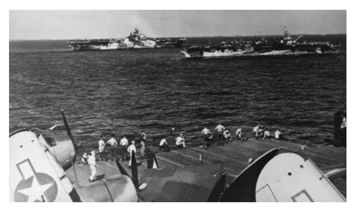
Essex and Independence class carriers, the fast carrier task forces were built around ships of these types 301754

30 August Second Strike on Marcus—Task Force 15 (Rear Admiral Charles A. Pownall), built around Essex , the new Yorktown and Independence launched nine strike groups in a day-long attack on Japanese installations on Marcus Island, the first strikes by Essex and Independence Class carriers, and the first combat use of the Grumman F6F Hellcat.