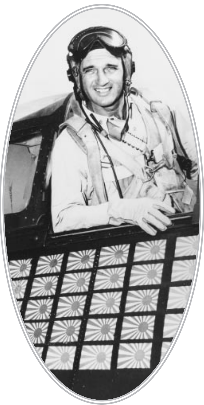
Navy Ace, David McCampbell 258198

against air and submarine attack (19–28 Nov) and another group performed the same services (14–23 Nov) for convoys from Ulithi. The Fast Carrier Force also continued support for 2 days attacking airfields on Luzon and in the Visayas (27–28 Oct), shipping near Cebu (28 Oct), and Luzon airfields and shipping in Manila Bay (29 Oct). In supporting operations during October, carrier aircraft destroyed 1,046 enemy aircraft.