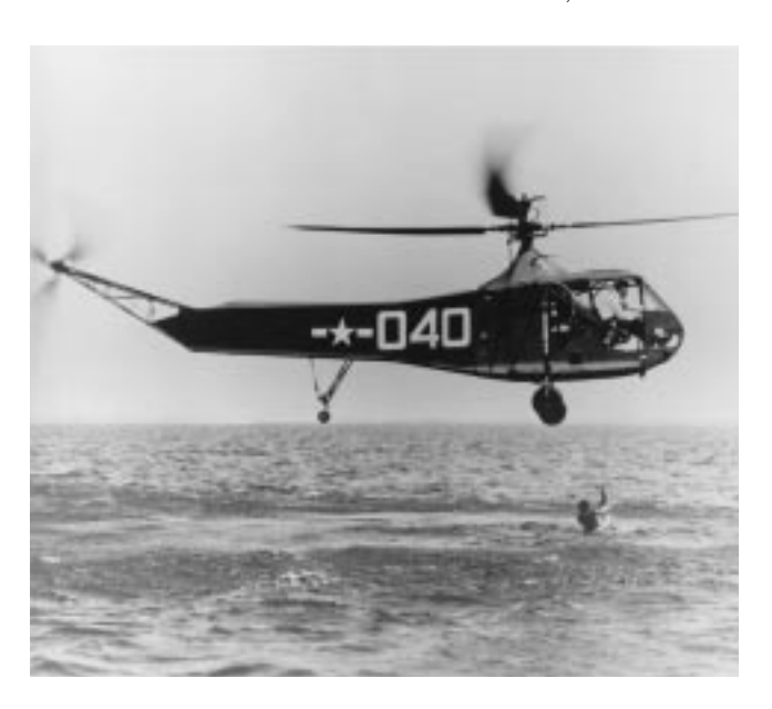
Coastguardsmen test capability of Navy's first helicopter, HNS-1, for air-sea rescue at NAS New York 1061902

16 October The Navy accepted its first helicopter, a Sikorsky YR-4B (HNS-1), at Bridgeport, Connecticut, following a 60 minute acceptance test flight by Lieutenant Commander Frank A. Erickson, USCG.