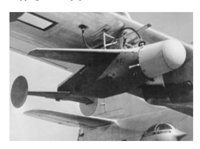
Bat, WWII automatic homing Navy missile 701606

23 April PB4Ys of Patrol Bombing Squadron 109 launched two Bat glide bombs against the enemy shipping in Balikpapan Harbor, Borneo, in the first