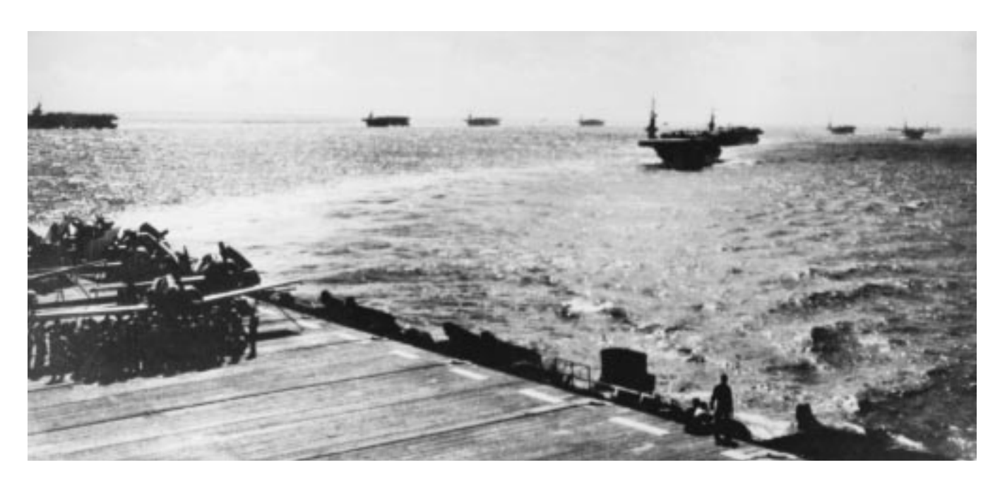
Escort carriers taking station to provide amphibious troops with close air support during an invasion 1053753