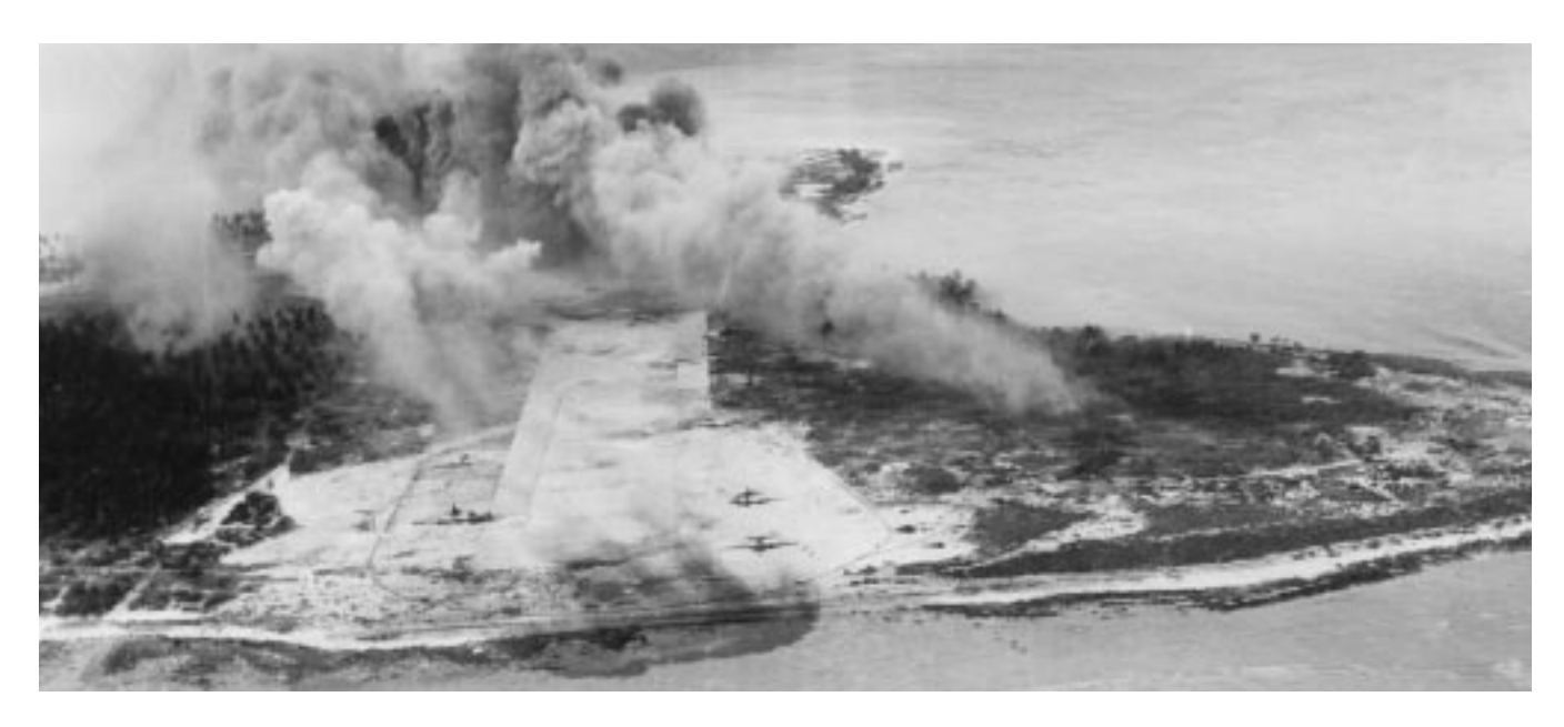
Invasion of the Marshalls. Japanese airstrip at Engebi burning after attack by U.S. carrier based planes 221248

2 February The last of the World War II ceilings for Navy aircraft, calling for an increase to 37,735 useful planes, was approved by the president.