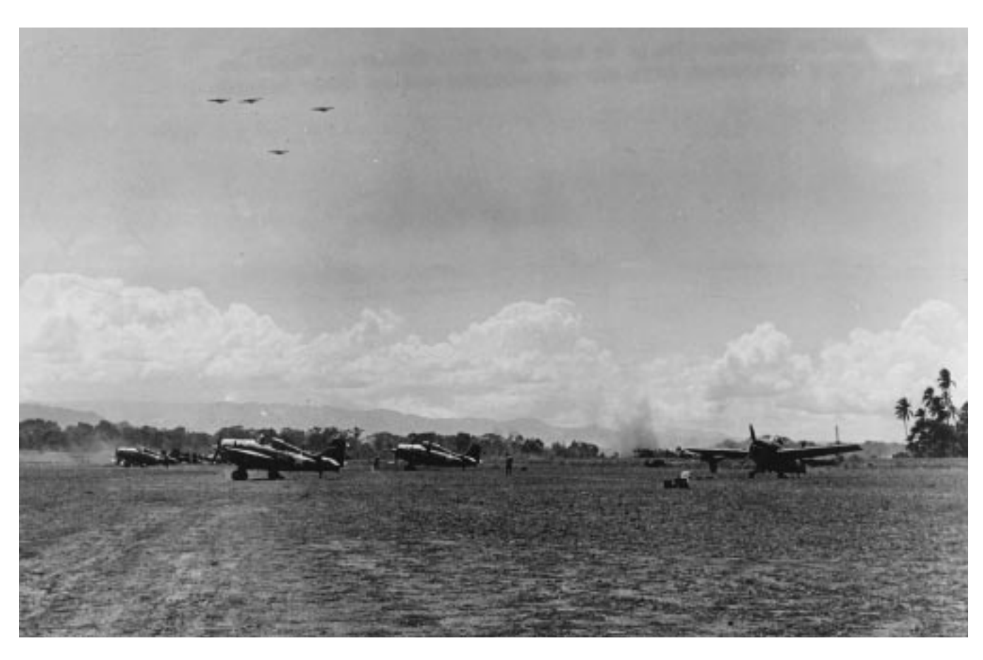
Marine fighters on Henderson Field. This airbase was vitally important during the Guadalcanal Campaign 45345

28 December The president directed that the Coast Guard be transferred from the Navy and returned to the jurisdiction of the Treasury Department.