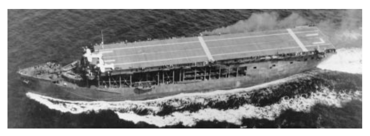
Long Island, first escort carrier of the U.S. Navy, was converted from the cargo ship Mormacmail 26567

2 June Long Island, first escort carrier of the U.S. Navy, was commissioned at Newport News, Va., Commander Donald B. Duncan commanding. Originally designated AVG 1, Long Island was a flush-