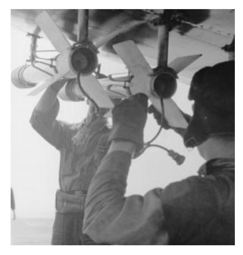
Rocket weapons, being installed on a plane 468849