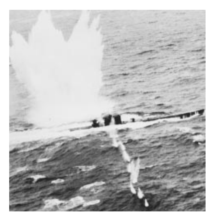
Exploding depth charge and line of splashes from machinegun bullets bring the end of German submarine 44360

In the course of the war, Navy and Marine pilots destroyed over 15,000 enemy aircraft in the air and on