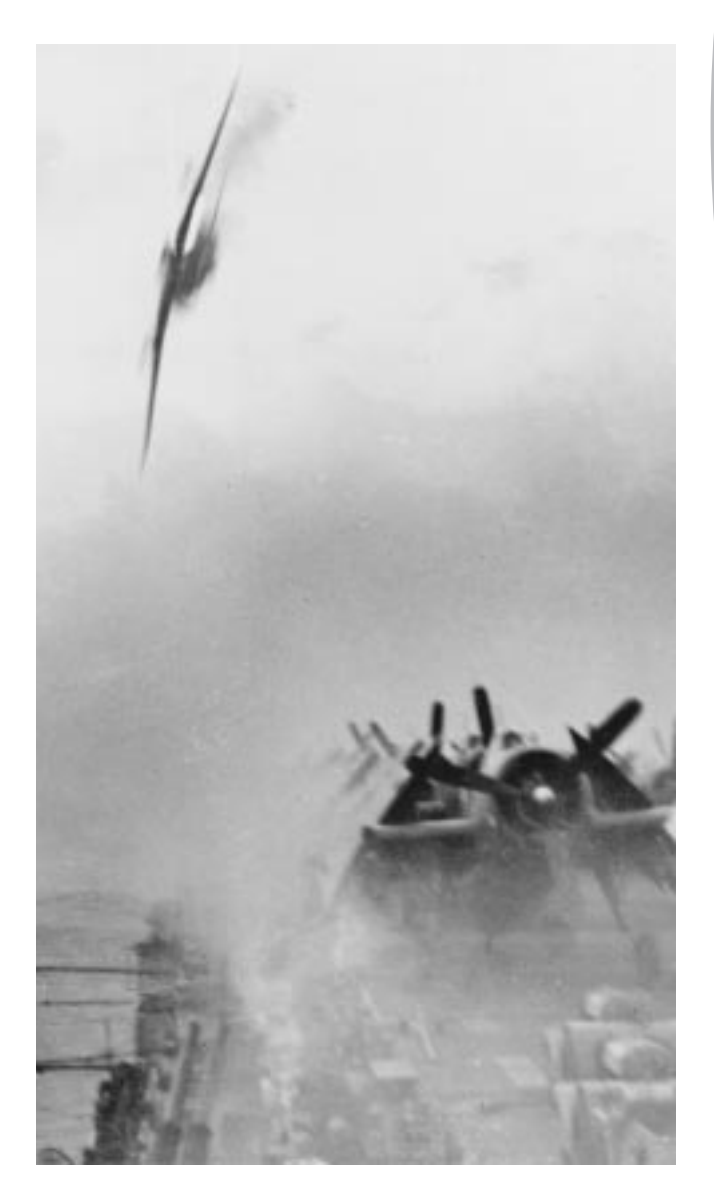
Kamikaze barely misses the carrier Sangamon 700580

Direct air support in the Leyte-Samar area was assumed by Allied Air based at Tacloban (27 Oct) and 2 days later the escort carriers retired. Later one group operated at sea to protect convoys from the Admiralties