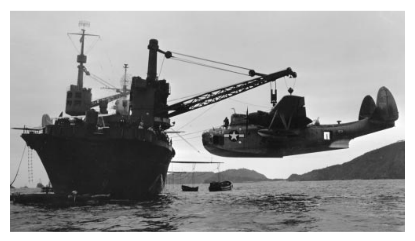
{\it Hoisting PBM Mariner aboard tender. Normal servicing was performed from boats~428461}