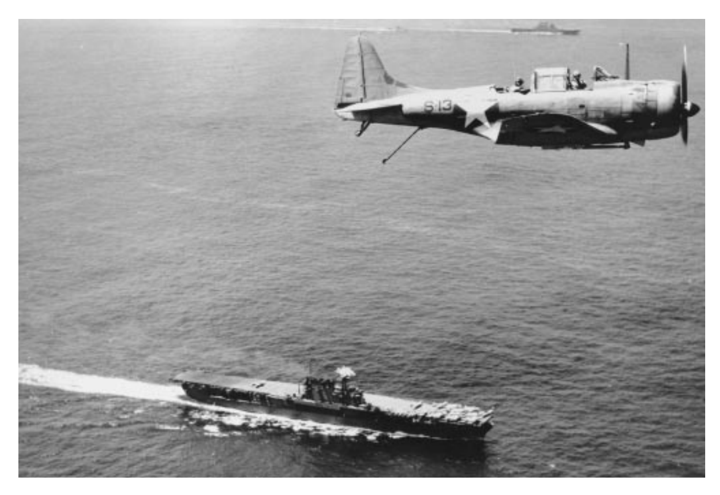
An SBD over Enterprise, Saratoga in the background, 1942