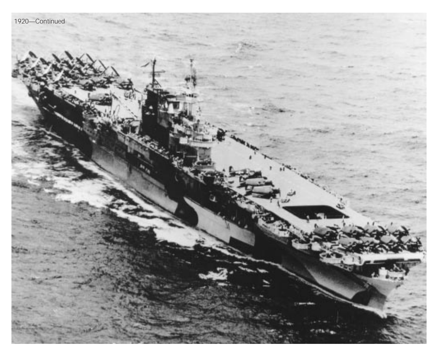
Enterprise, known as "The Big E" was in almost continuous action during World War II 704377

headed to deliver a Marine Scout Bombing Squadron. Enterprise was also at sea about 200 miles west of Pearl Harbor, returning from Wake Island after delivering a Marine Fighter Squadron there. Her Scouting Squadron 6, launched early in the morning to land at Ewa Airfield, Hawaii, arrived during the attack and engaged enemy aircraft.