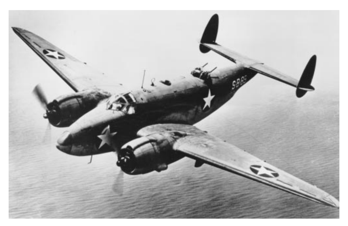
PV-1, Medium range land-based patrol plane 41693