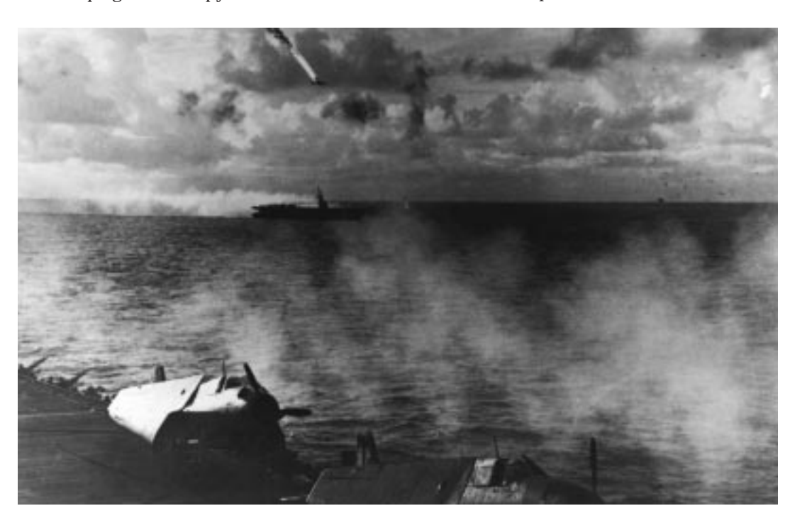
A Japanese plane shot down during an attack on the escort carrier Kitkun Bay, Marianas Campaign 238363

As the campaign neared successful completion, three groups of Task Force 58 left the area temporarily for strikes on the Western Carolines (25-28 Jul). Palau, Yap, Ulithi and other islands were taken under attack