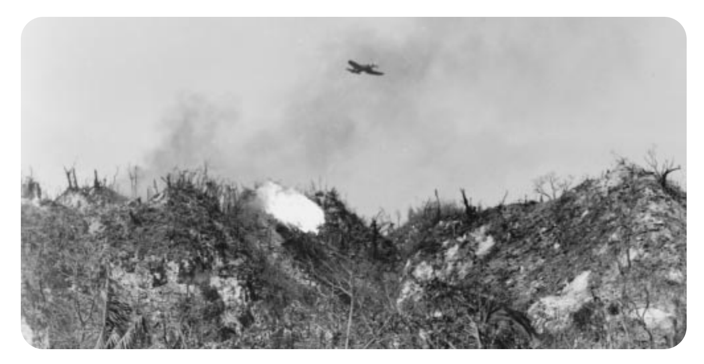
Fire spreads from napalm dropped by Marine fighter flying air support during Peleliu invasion USMC 97976