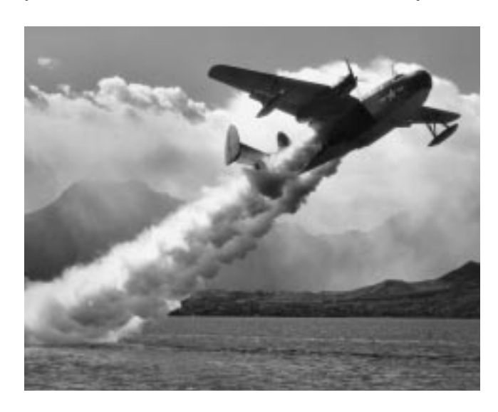
Launching a PBM Mariner, a dramatic demonstration of the utility of newly developed jet-assisted takeoff (JATO) 415346

21 May The Bureau of Aeronautics requested the Engineering Experiment Station, Annapolis, Md., to undertake development of a liquid-fueled assisted takeoff unit for use on patrol planes. This marked the Navy's entry into the field that later came to be called jet assisted takeoff (JATO), and was the Navy's first