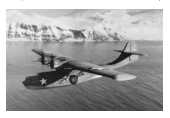
A PBY Catalina flying over the Aleutians near Adak 405443

30 August The occupation of Adak, Alaska, by Army forces and the establishment of an advanced seaplane base there by the tender Teal, put North Pacific forces within 250 miles of occupied Kiska and in a position to maintain a close watch over enemy