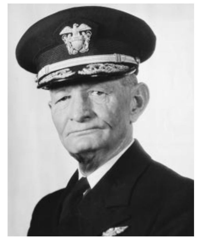
VAdm. John S. McCain, USN 236837

29 August The formation of combat units for the employment of assault drone aircraft began within the Training Task Force Command as the first of three Special Task Air Groups was established. The component squadrons, designated VK, began establishing on 23 October.