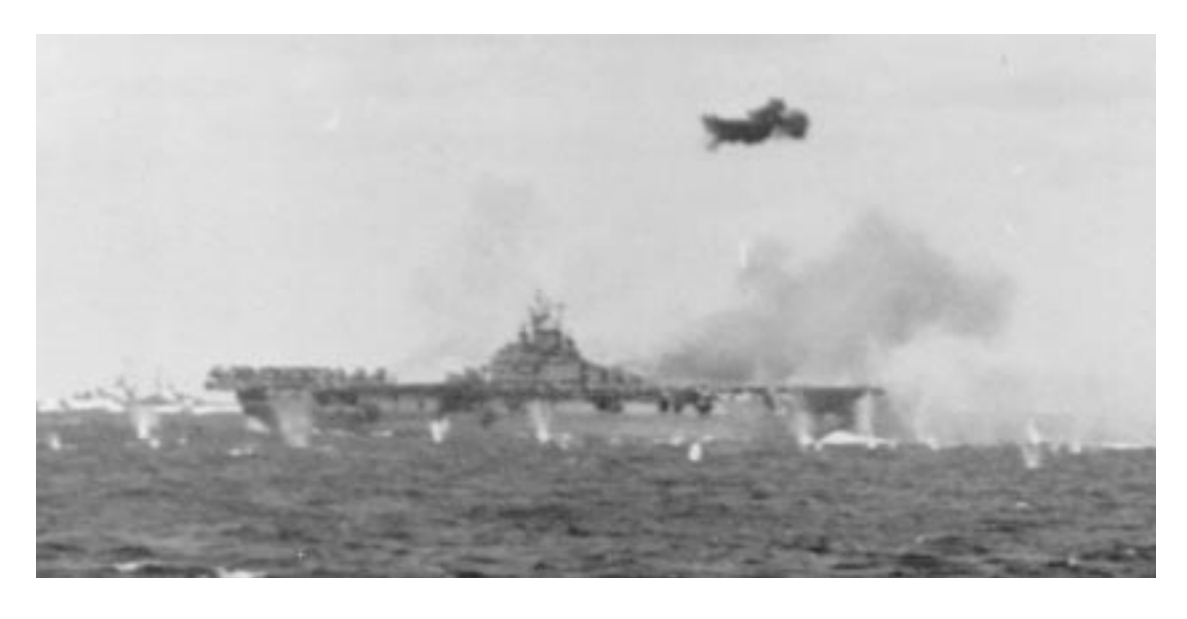
A Japanese bomber, hit by antiaircraft guns while attacking an Essex class carrier, leaves a trail of fire 313866

Task Group 52.1 (Rear Admiral C. T. Durgin), originally 18 escort carriers strong, conducted pre-assault strikes and supported the occupation of Kerama Retto (25-26 Mar), joined in the pre-assault strikes on Okinawa (27-29 Mar) and, from a fairly restricted operating area southeast of the island, supported the landings and flew daily close support for operations ashore until the island was secure (21 Jun). The arrival