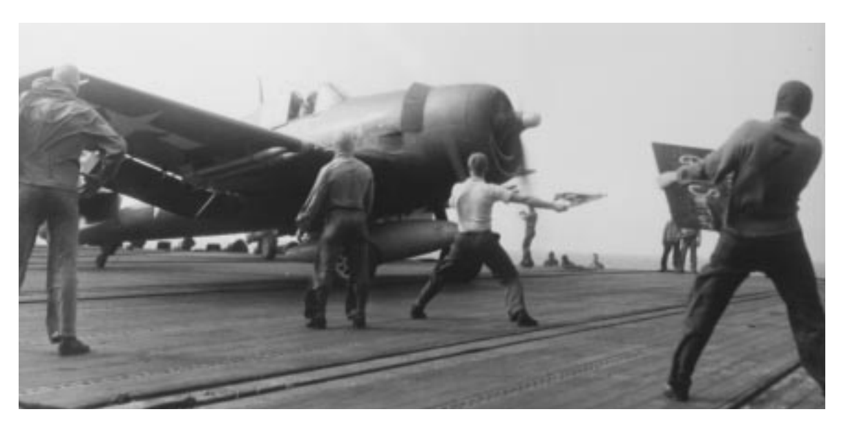
Grumman F6F Hellcat laden with rockets and droppable fuel tank taking off from Hancock 259064

15 September Fleet Air Wing 17, Commodore Thomas S. Combs commanding, was established at