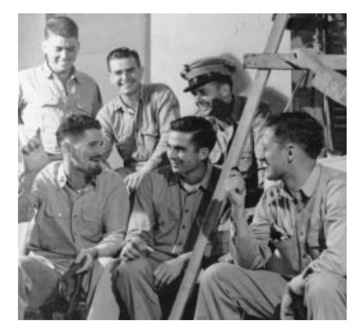
USMC Ace Joe Foss tells how one almost got away 35197