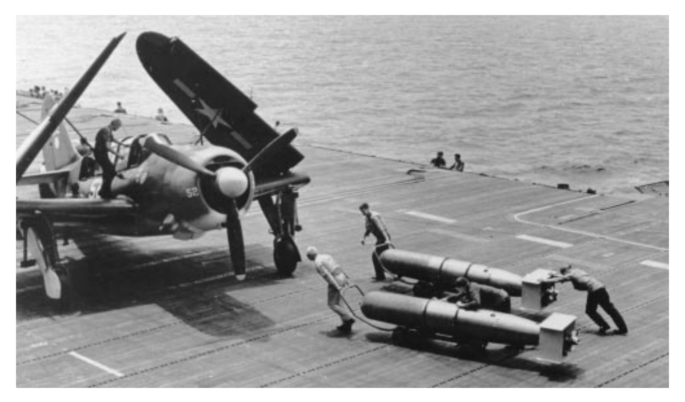
Loading torpedoes on SB2C for strike on ships 1053796