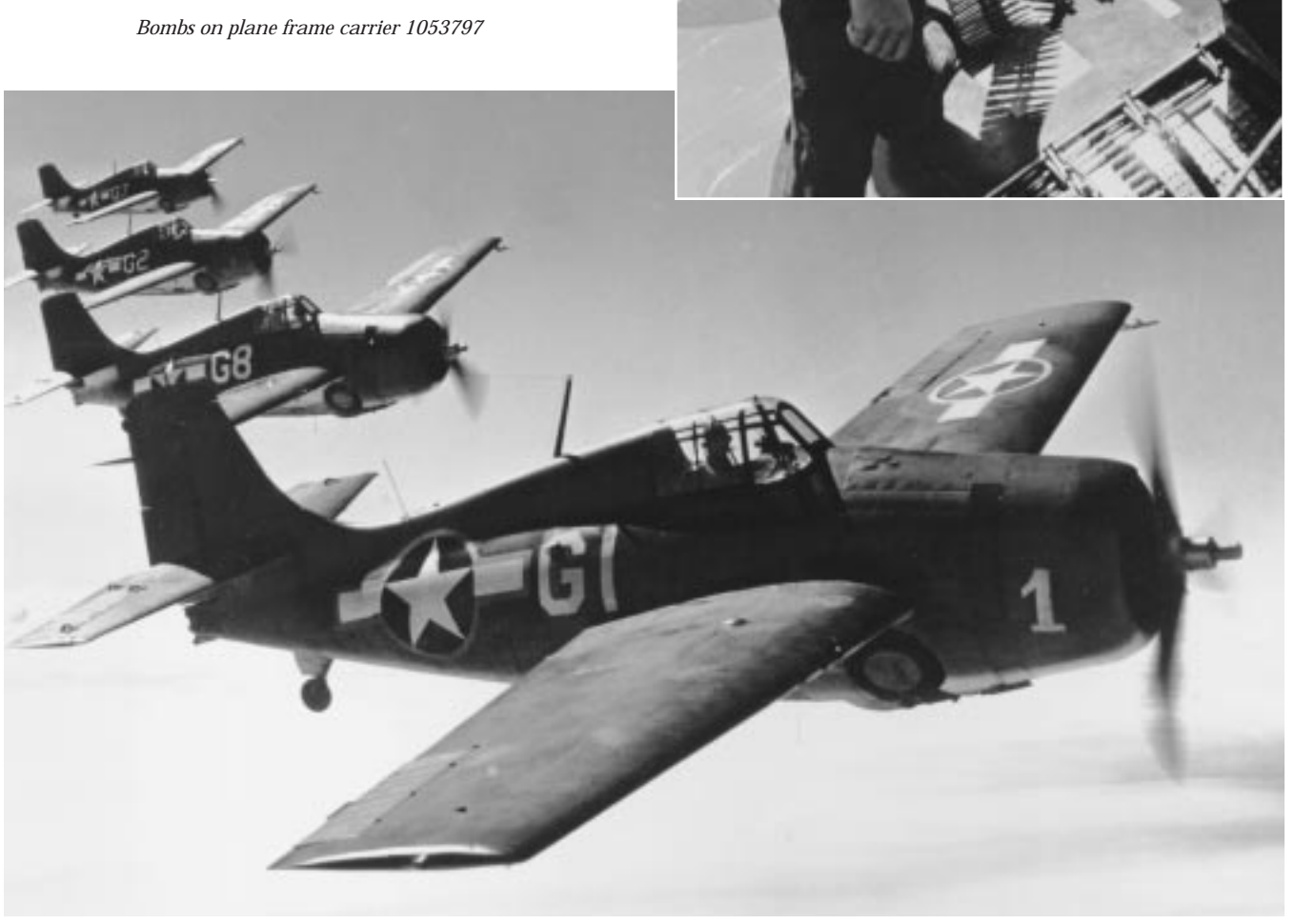
Navy night fighters, a flight of F6F Hellcats painted black 407243